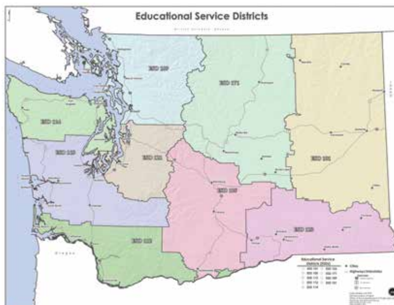
Exhibit 3 – Washington's ESDs

The state's nine ESDs support school districts in their regions (shown in Exhibit 3) through a variety of services, including mental and behavioral health assessments, threat assessments and training opportunities. ESDs provide planning resources and regionally consistent coordination. Although the individual safety support services each ESD offers depend on the availability of resources and staff expertise, at a minimum they can include trainings or threat assessments. ESD staff are often available to attend regional safety meetings; a few school districts have a memorandum of understanding with their ESD for added accountability and meet monthly if not more frequently. ESDs that have an established safety program or co-op may also assess safety plans, send reminders about drills, and help districts complete their drill requirements. Having a more regional view of school safety helps account for local needs and risks, and can provide accountability that a single state agency may struggle to offer. One ESD in particular serves as a model for regional safety coordination.